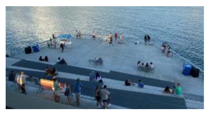
Beaches, restaurants, discovery centers, splash pads, fishing areas, and open green space combine to provide a variety of activities.