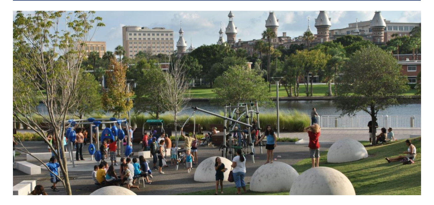
Curtis Hixon Park, located next to the Straz performing arts center, is home to numerous popular city festivals and events.