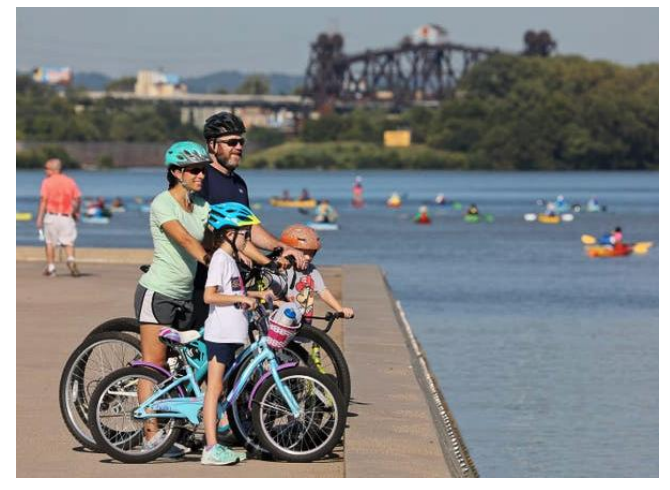
Subway Fresh Fit Hike, Bike & Paddle 2018