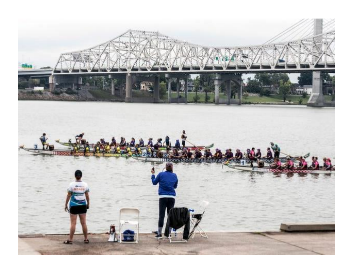
Louisville Dragon Boat Festival