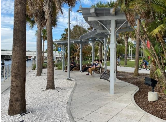
The Tampa Riverwalk

Tampa's downtown is graced by numerous waterfront parks and trails: Curtis Hixon Park, Julian B. Lane Riverfront Park, Water Works Park, and a 2.4 mile connected Riverwalk with plans to add 22 more miles.